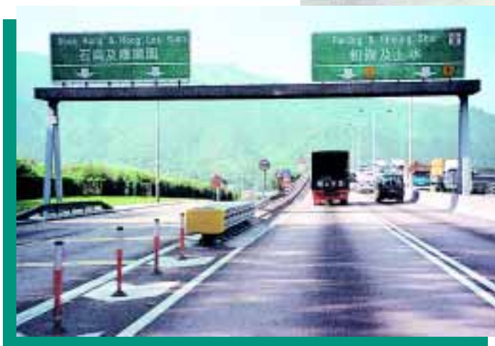
路政署為改善道路安全而引入的風琴式防撞軟墊護欄。 Crash Cushion System introduced by Highways Department.