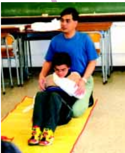
學習急救課程（交通安全隊隊員）。 Road Safety Patrol members participating in a first aid course.

香港交通安全隊的運作，是由香港交通安全會負責監督。隊員和志願長官的數目共有 10 380 人；隊員包括幼稚園和中、小學的學生，以及長者中心的成員。該隊的總監是由香港交通安全會的執行委員會所委任，任期有所屆定。至於隊內的長官全部屬志願人士。