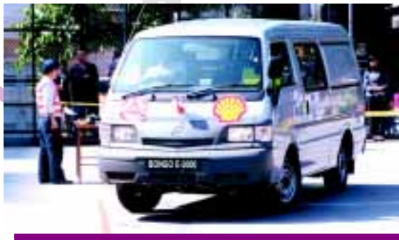
香港汽車高級駕駛協會舉辦的「一杯水」駕駛安全比賽。 Driving Skill Competition organised by IAMHK

In 2000, the IAMHK continued to co-organise driving activities including the 3rd Transport Day combined with the Commissioner for Transport's Driving Skill Competition which saw the largest number of 72 traffic-related organisations participating at Victoria Park.