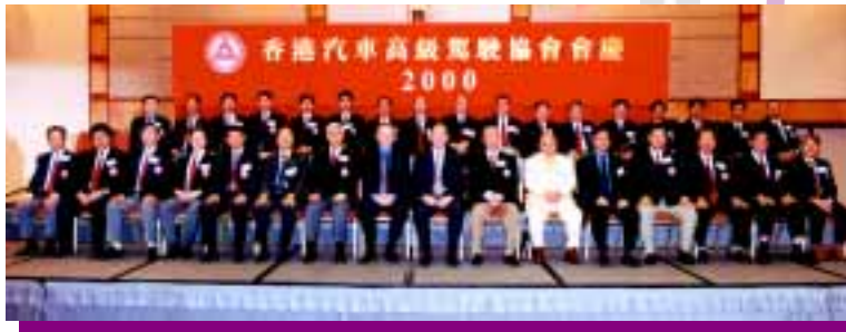
香港汽車高級駕駛協會會慶。 IAMHK Anniversary

香港汽車高級駕駛協會是一個非商業性、非牟利的興趣組織，以追求最高的駕駛水準、致力提升香港的道路交通安全為目標。協會的所有會員，必須成功通過一項由該會主辦的高級駕駛考試，能夠表現出具備高水平的駕駛技巧、決意對其他道路使用者包括行人在內的安全承擔責任，才能加入該會成為會員。