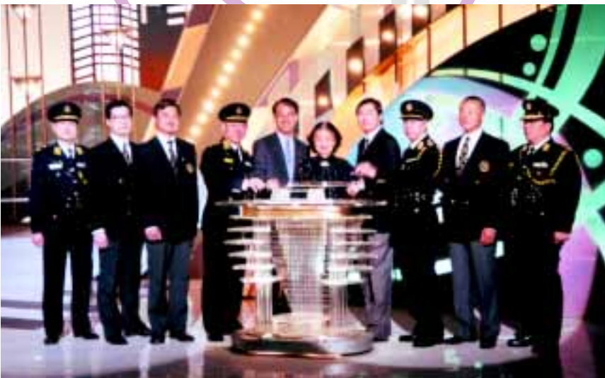
歡樂今宵之交通安全新領袖特備電視節目，由律政司司長梁愛詩太平紳士主禮。 'EYT' programme on Road Safety Patrol officiated by the Secretary for Justice, Elsie LEUNG, JP.

In recent years, the Association, in conjunction with the Patrol, has increased liaison with its counterparts in several cities and provinces in the Mainland, to promote the establishment of road safety patrols in their schools and share experiences in arousing people's road safety awareness. The Association and the Patrol members will continue to devote themselves in promoting road safety in Hong Kong.