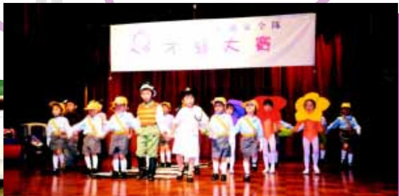
交通安全隊舉辦之幼兒交通安全隊才藝大賽。 RSP (Kindergarten Team) Talent Show Competition.

When the Association was first formed, it was mainly financed by donations from members of the general public and commercial firms. After its formation of the Hong Kong Road Safety Patrol in 1963, the work of the Association started to expand. The Government gave official recognition to the Association in 1965 by granting an annual subvention to partially meet its administration expenses and in 1970 a piece of land at concessionary rate for its Headquarters Building.