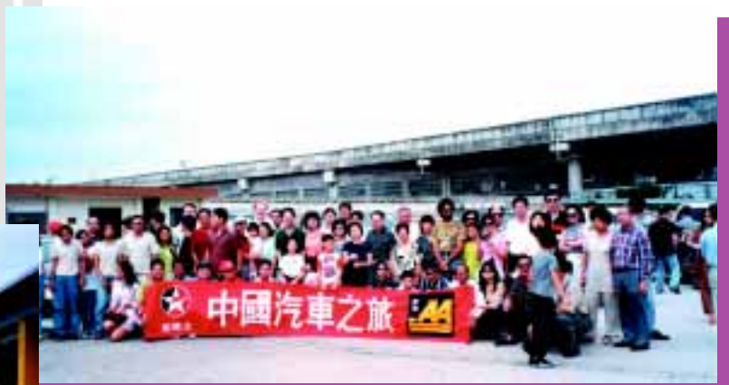
中國汽車之旅。 HKAA activity.

The HKAA has worked in conjunction with similar