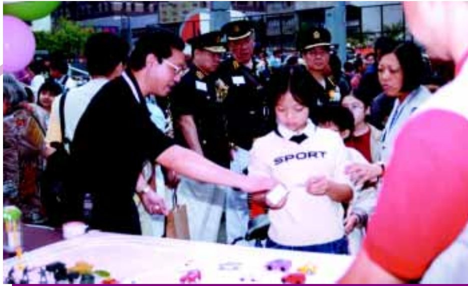
交通安全隊舉辦的道路安全嘉年華會。 Road Safety Carnival organised by RSP.

Commissioner who is appointed by the Association's Executive Committee to serve for specified terms heads the Patrol.