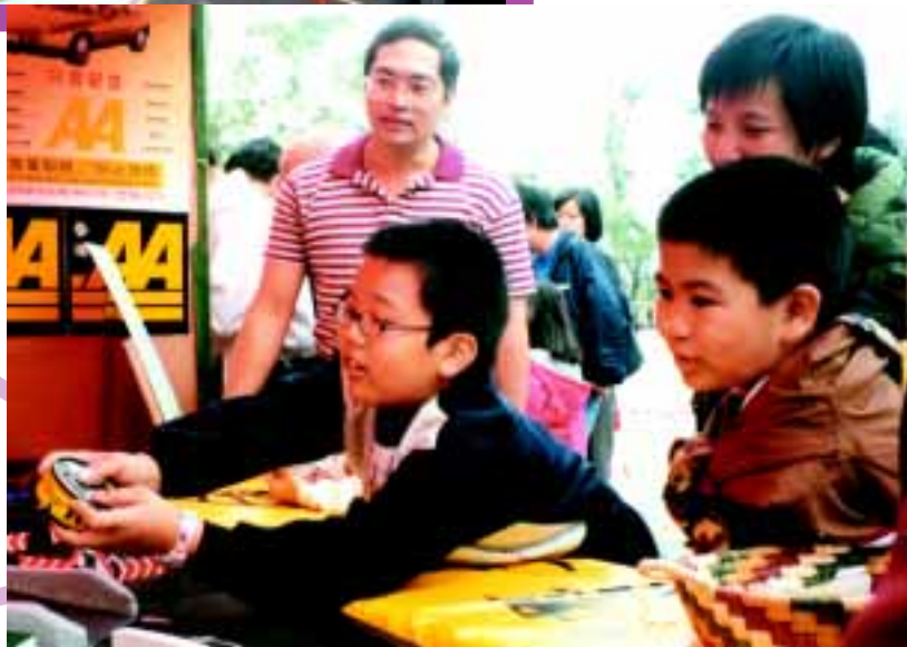
香港汽車會（交通運輸安全同樂日）。 HKAA at Transport Day.

該會致力向駕駛人士推行安全駕駛、爭取合理的交通條例，亦緊隨社會發展的步伐，推行相應的新概念及新價值觀，與政府各有關部門繼續緊密合作，建設一個既安全而又不受污染的駕駛環境。