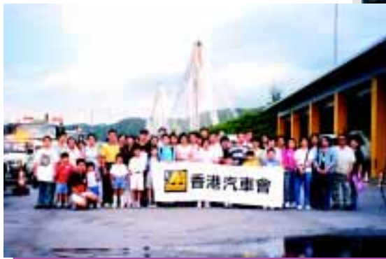
香港汽車會會員活動。 HKAA activity.

該會不但與世界各地的同類組織緊密聯繫，更把駕駛人士團結起來，共同爭取福利和權益。隨著該會的成長和與時俱進，