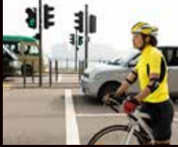
遵守交通規則，遵照交通標誌、道路標記和燈號的指示行車 Obey traffic rules, traffic signs, road markings and traffic light signals on the road