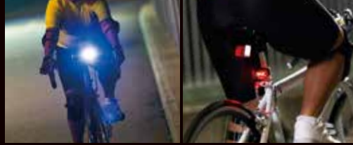
在黑夜或能見度低時，須亮起車前白燈及車後紅燈 Show a white light at the front of your bicycle and a red light at the rear when riding in the dark or at times of poor visibility